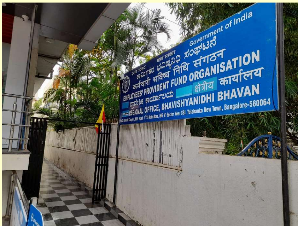
Regional Office Yelahanka

Recognizing the claimant's difficulties, a collaborative approach was adopted between RO Noida and RO Yelahanka, with the OICs of both offices taking personal interest in the case.