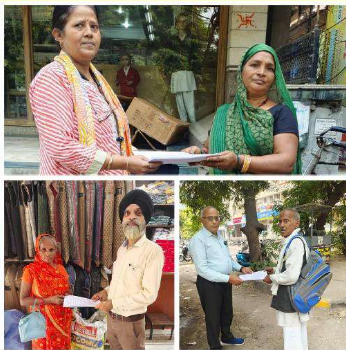
PPO Distributions by Regional Office Agra

In this manner, RO Agra efficiently performed its duty, providing relief and rightful benefits to another family in distress.