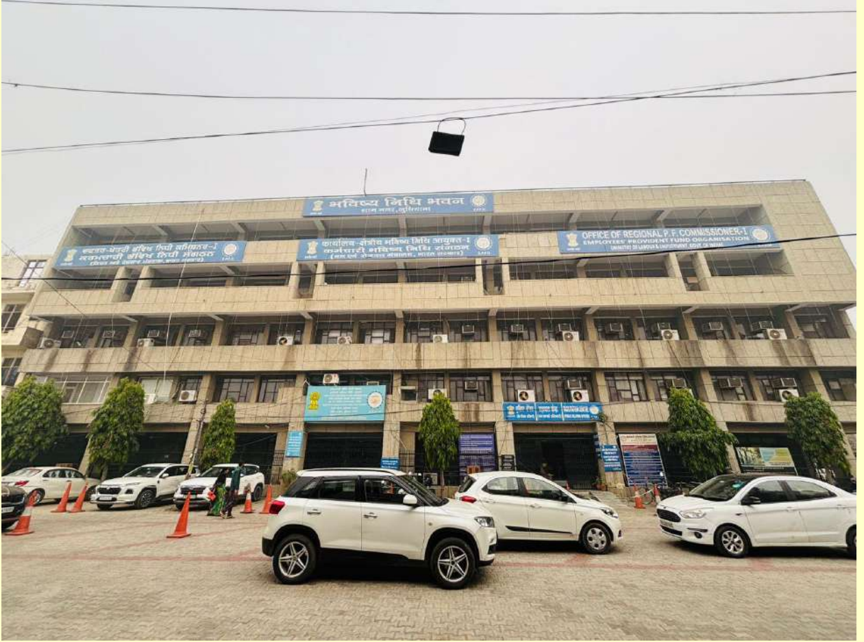
Regional Office Ludhiana