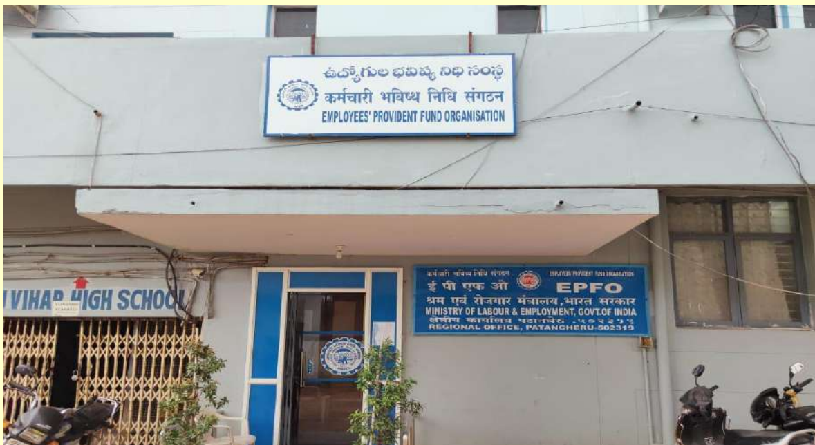
Regional Office, Patancheru

The pensioner was very pleased and delighted by the completion of the process at his residence. Furthermore, his family members expressed their gratitude and appreciation for the efforts taken by the Regional Office, Patancheru.