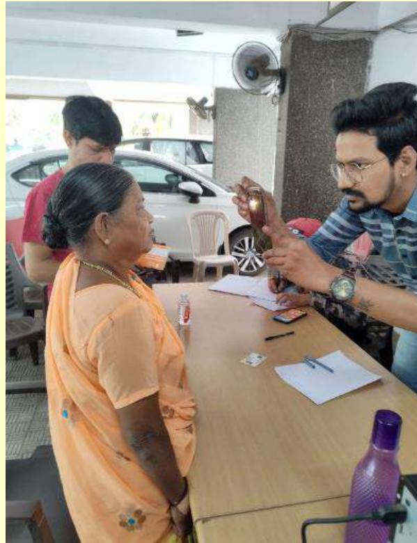
DLC Submission through Face Authentication Technology

The pensioner expressed her gratitude and appreciated the efforts of the EPFO officials for their assistance.