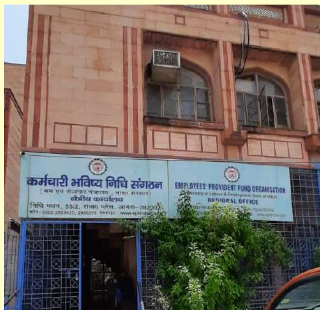
Regional Office Agra

Additionally, the office managed to get another PF account of the deceased, which was under RO Bandra, transferred into his current PF account for a comprehensive and positive settlement. Ultimately, the claim was settled, and the family received their due benefits without any hassles. The family was provided with a total of ₹8,292 for PF benefits and ₹5,600 for EDLI benefits. Furthermore, the pension case was transferred to RO Muzaffarpur, the family's resident district, for the commencement of pension.