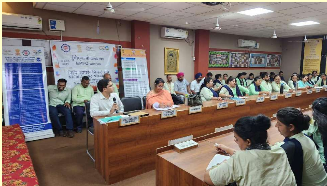
Nidhi Aapke Nikat camp at Punjab