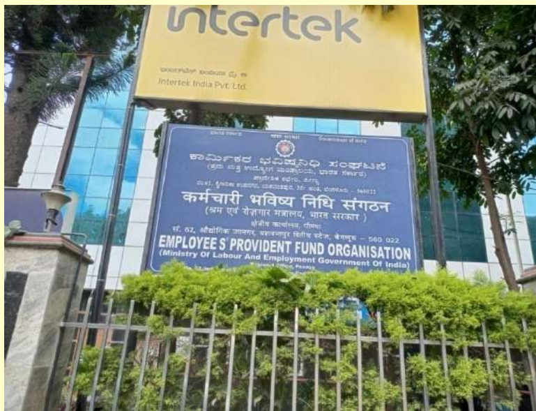
Regional Office Peenya

After receiving the claim forms and supporting documents, the Pension staff at RO Peenya, under the guidance of their officers, worked diligently to process the claim immediately and released the pension arrears from 1997 to the present. The total pension arrears amounted to ₹525,615 for the widow and ₹65,607 for the son.