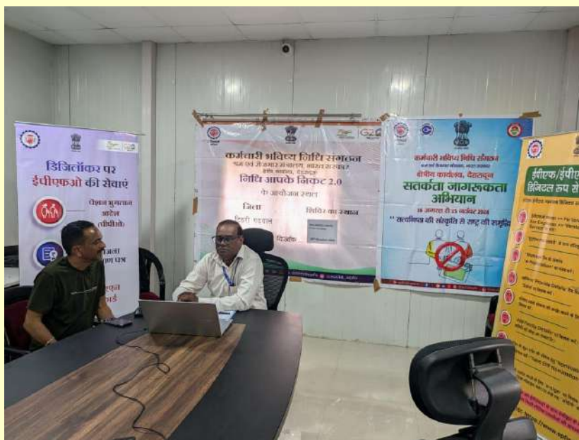
Addressing Grievance in Nidhi Aapke Nikat camp Dehradun

There are several similar cases where the Regional Office, Dehradun, takes up matters suo motu and steps forward to assist those in need as a matter of duty. The challenges posed by difficult geographical terrain do not deter the spirit of public service upheld by this esteemed office. This image correction for the department is essential, and it brings immense satisfaction that, as an organization, we are progressing in that direction day by day at a rapid pace.