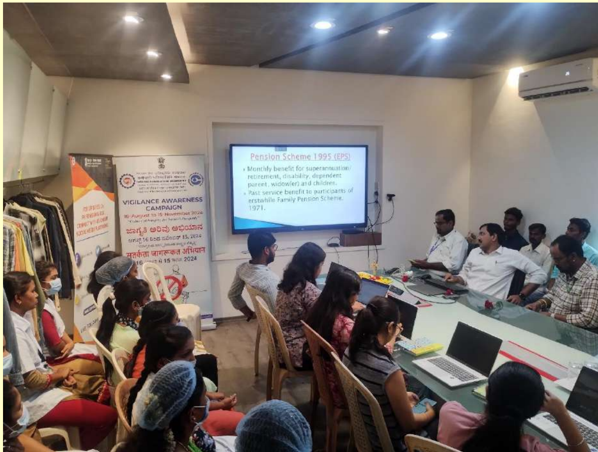
Nidhi Aapke Nikat Camps at Bengaluru

In response, RO, Peenya took immediate action. The Area Enforcement Officer (EO) was deputed to investigate the matter and submit a comprehensive report. The EO quickly reported that the establishment, M/s. SSE Manpower Consultancy Ltd, fell under the jurisdiction of RO, Peenya. The EO contacted the deceased employee's family, who were natives of Assam and not residing in Bengaluru at the time. The benefits available under EPFO were explained to the family over the phone. During a subsequent visit to Bengaluru, the beneficiary submitted the claim forms on 07.10.2024.