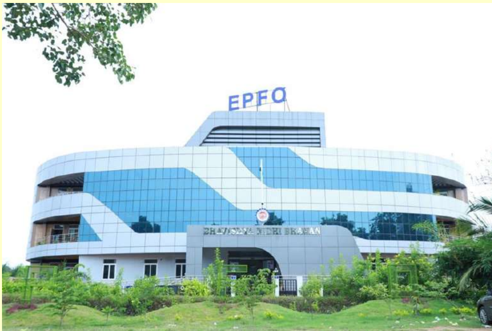
Regional Office Salem

The claimant expressed her appreciation for the assistance provided in properly submitting the claim and for the efforts made by the office for the immediate settlement. She conveyed her gratitude for the support provided, which gave her the strength to navigate through her difficult time.