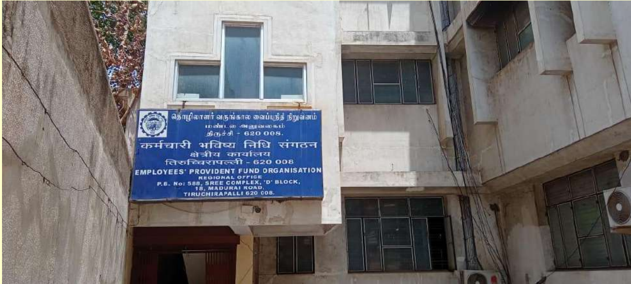
Regional Office Trichy