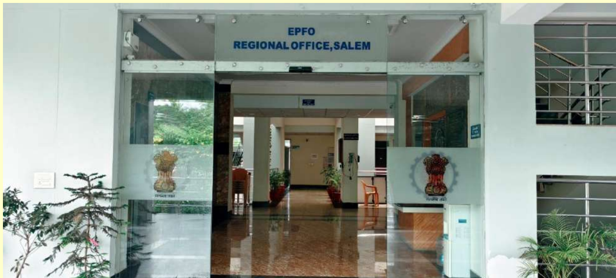
Regional Office Salem

The office provided her with guidance on how to fill out and submit the claim applications along with required documents. Further, she was informed about other eligible benefits and advised to submit the relevant documents for them as well. Once the claim and required documents were received, they were immediately verified and recorded. The claim was processed as soon as it appeared in the system. The EPF, EDLI, and pension claims were processed, and a Pension Payment Order (PPO) was issued under as a priority.