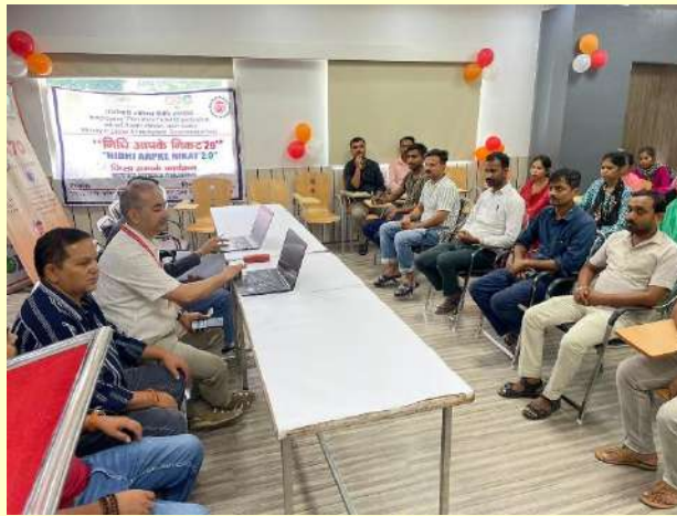
Nidhi Aapke Nikat camp at Shimla