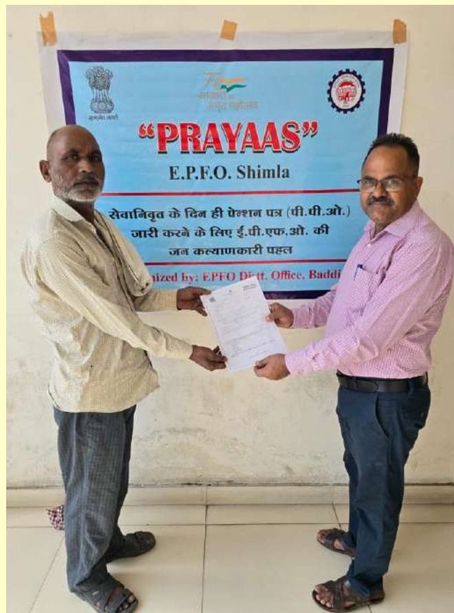
PPO Distribution in Regional Office Shimla